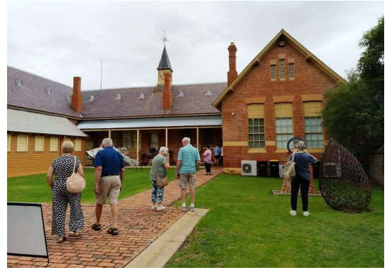
Peppin heritage Centre Deniliquin