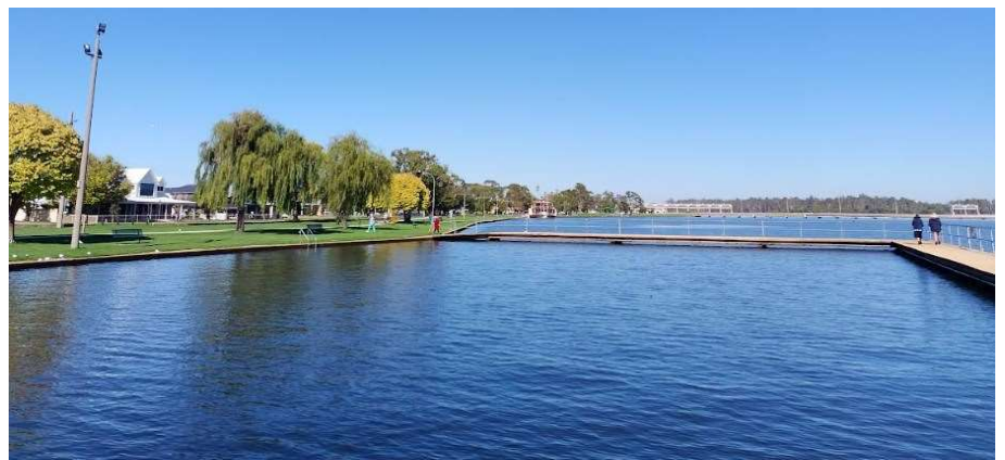
Yarrowonga foreshore Reserve Lake Mulwala for morning tea