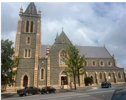
Goulburn Catholic Cathedral