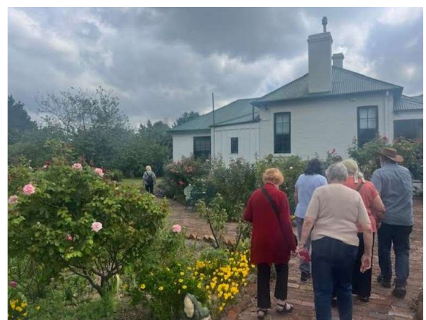
Garroorigang Historic Home of the Hume family