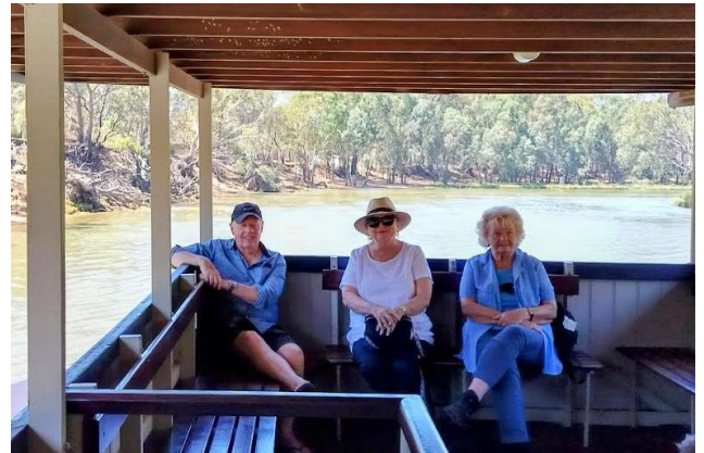
Ferry trip on the mighty Murray River out of Echuca