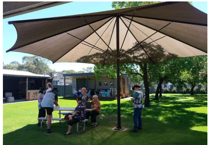
Lunch at Buller Wines, Rutherglen