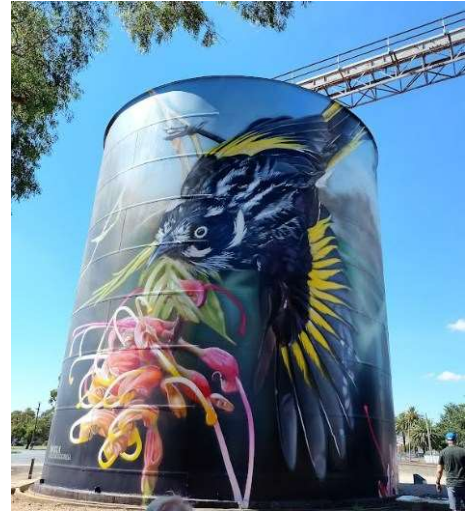
Beautiful painted silos Rochester