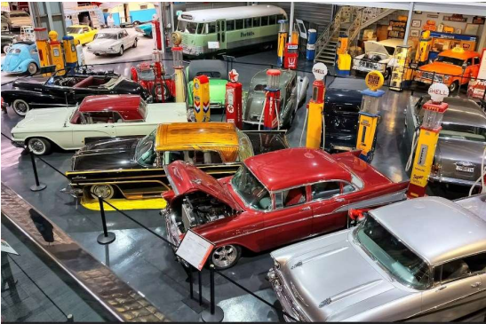
The Depot Deniliquin vintage car museum