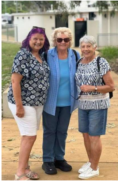
Some very happy trippers