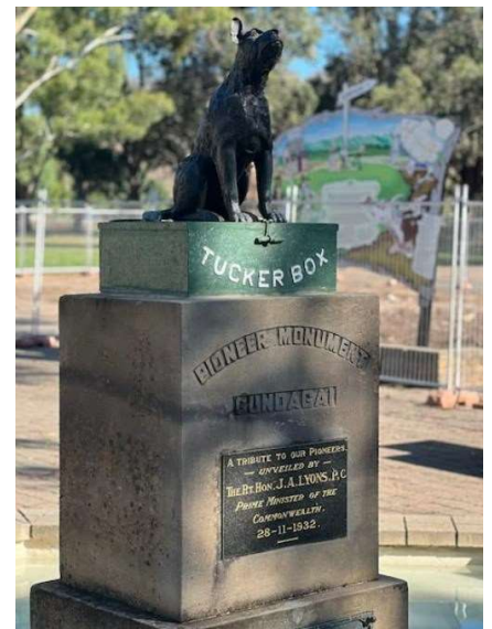
Two Icons Goulburn and Gundagai