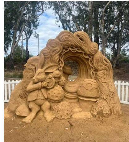
Sand models Echuca